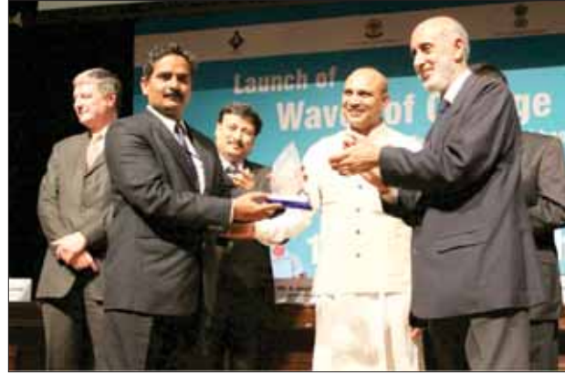
Our Principal receiving National School Sanitation Award 2012 from Honourable HRD Minister Pallam Raju