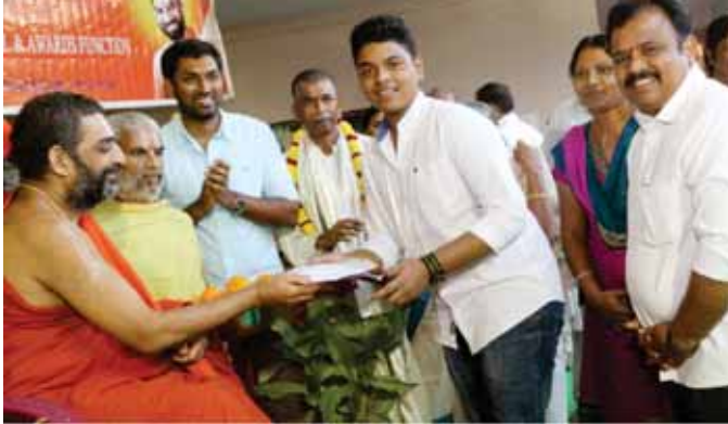
H.H. Sri Sri Chinna Jeeyar Swamiji awards Gold Medal to the AISSE topper